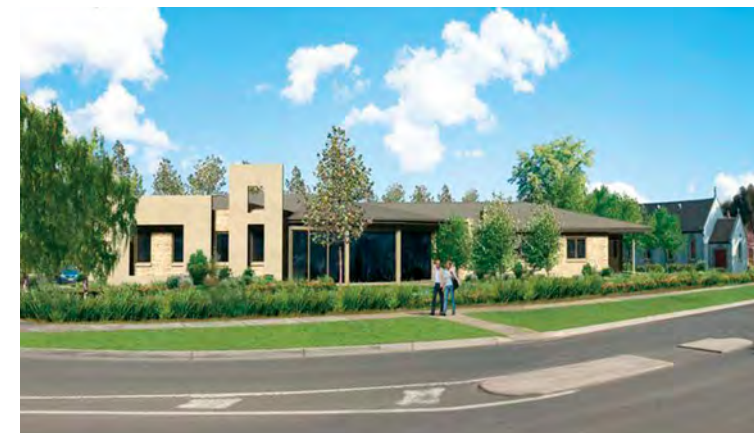
WYNDHAM STREET VIEW

A team of qualified, experienced and compassionate Staff are in attendance 24 hours per day and a rigorous recruitment, induction and continuous training program is in place to ensure the highest standard of commitment and professional care is delivered to all residents in our government approved home.